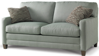
FULL SLEEPER Full Sleeper Sofa