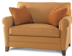
TWIN SLEEPER Twin Chair & 1/2 Sleeper.

Add the arm style, choose baseball stitch or welted trim, and then the leg selection to create your own sleeper.