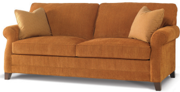
QUEEN SLEEPER Queen Sleeper Sofa

MULTIPLE SLEEPER OPTIONS: SLEEPER UNITS THAT COMBINE COMFORT WITH FUNCTION AND FASHION.