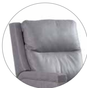
C=Contemporary Wing Single Back