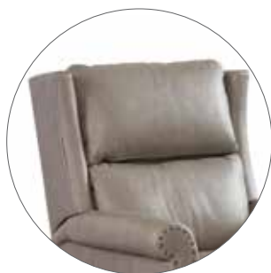
B=Traditional Wing Bustle Back