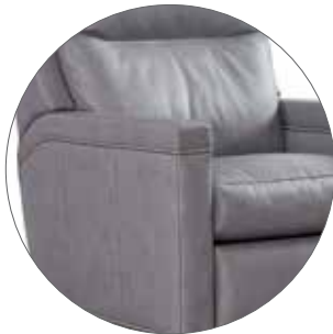
C=Cap Arm #1FN Standard Base and Arm Cap