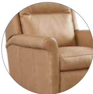
S=Sock #1FN Standard Base Only