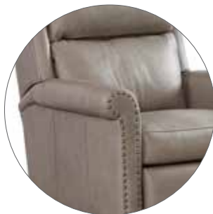
R=Rolled Arm #1FN Nails Spaced Base And Arm Panels