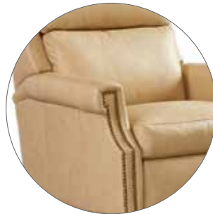
L=Lawson #1FN Standard Base and Arm Panel