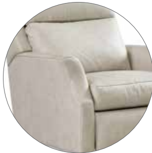
F=Flare Arm #1FN Standard Base Only