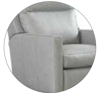
T=Track #1FN Standard Base Only