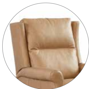
A=Traditional Wing Single Back