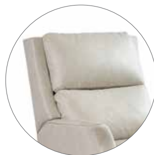
D=Contemporary Wing Bustle Back